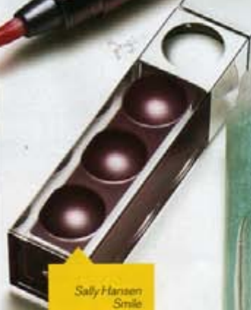
Sally Hansen Smile Brightening Lip Treatment in Brilliant, $7, walgreens.com