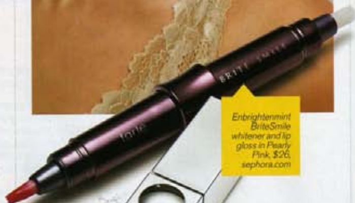
Enbrightenmint BriteSmile whitener and lip gloss in Pearly Pink, $26, sephora.com