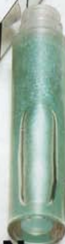
JK Jemima Kidd Maxi Kiss Plumping Lip Gloss in Angelina, $17, target.com